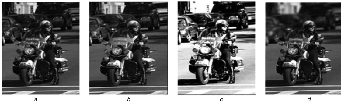
Fig. 5 Image retouching examples