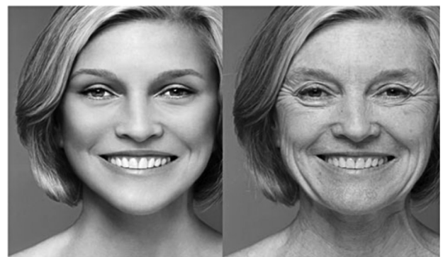
Fig. 6 Retouching by a magazine in which the real face on right is replaced with the left one

A blind identification algorithm, for the retouching forgery is based on the bi-Laplacian filtering [82]. This technique searches for each block of the image on the basis of a KD tree and derives the adjacent matching blocks. The technique is applicable to the uncompressed images and compressed high-resolution images. The accuracy also