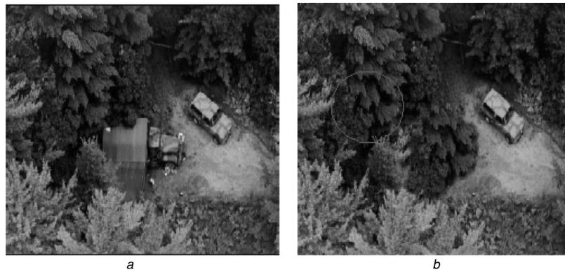
Fig. 2 Example of copy-move forgery