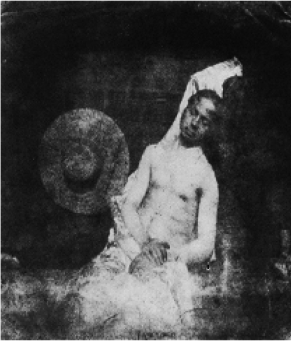
Fig. 1 First fake image

determined to be fake through forensics analyses [10]. With the passage of time, many advanced software editing tools have been made available to the end users who can now easily alter an image with little or no effort. With such a long history of forgeries, photography, especially digital photography has lost its innocence. Over the past few years, many techniques have been introduced to tamper images or videos. These techniques can be classified into following three general categories [2, 8]: